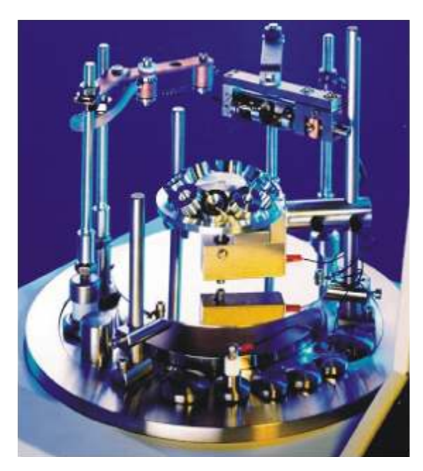
Auto306 by resistance and carbon sources for SEM.The Rotatilt3 work holder is fitted by the SEM planetary sample holder