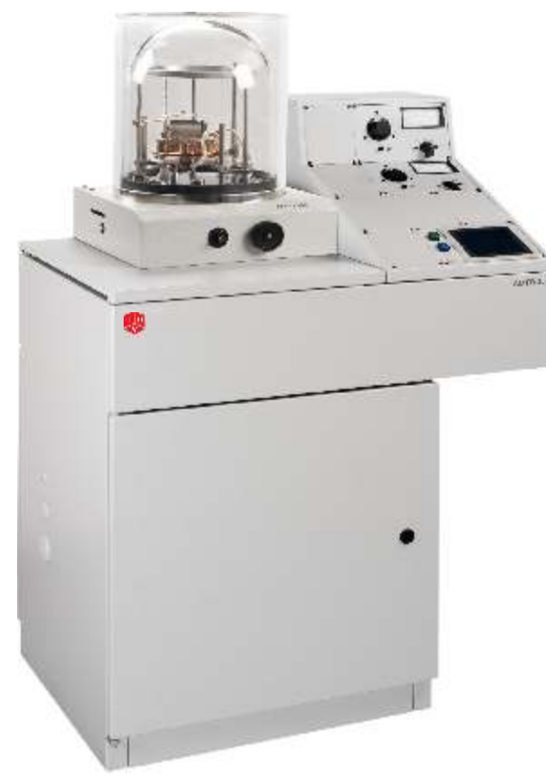
Auto 306 with glass bell jar chamber