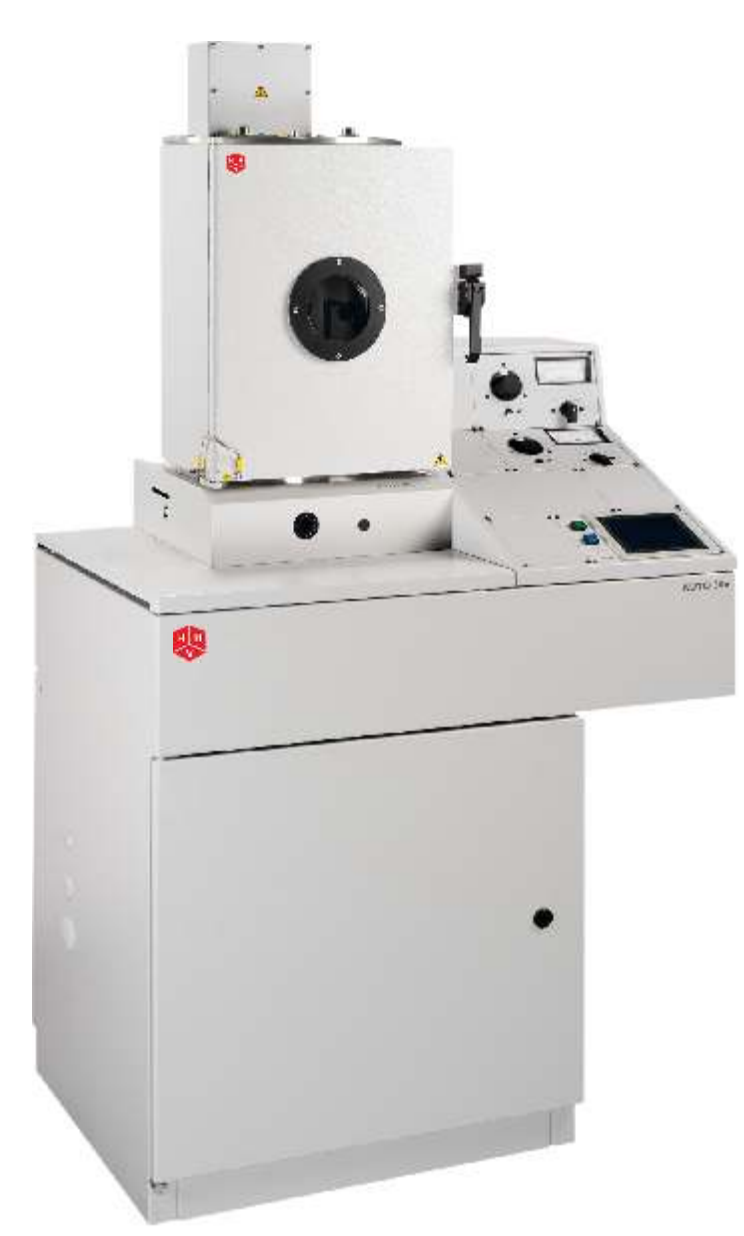
Auto 306 coating system with FL400 front loading chamber

The vacuum system is controlled and monitored by a rugged PLC with touch screen for easy operation. Pumping options include diffusion, turbo and cryo pumps with oil-sealed or dry scroll backing pumps. An integrated high vacuum valve with backup battery protects pumps and samples.