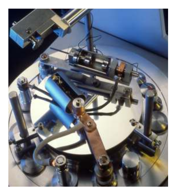
Auto306 with resistance and carbon sources for SEM, and Rotatilt3 with TEM grid holder