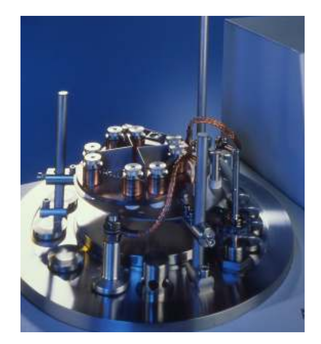
Auto306 with 4-position turret resistance source