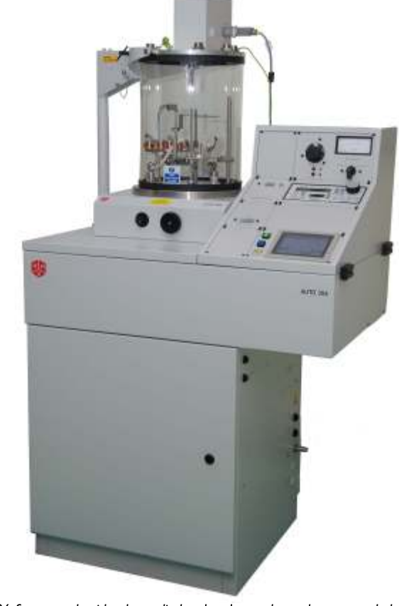
Auto306 for research with glass cylinder chamber and top plate counterbalance