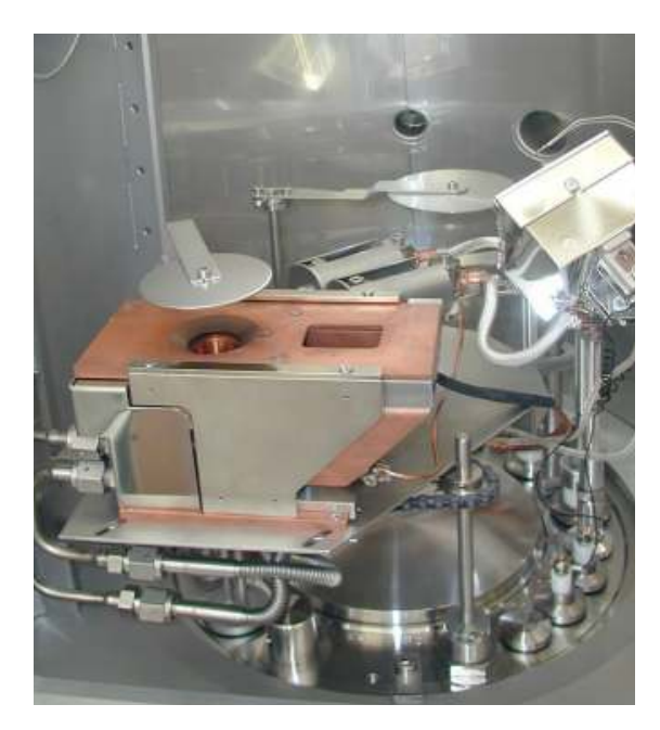
Electron beam source, two resistance sources and quartz lamp substrate heater.