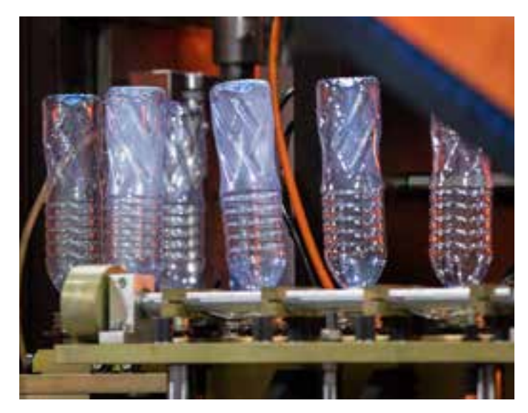
Plastic bottle moulding

Once the fluorination process is complete, the chamber and pipelines are flushed with nitrogen multiple times by bringing the vacuum chamber to 1 mbar and releasing to the atmospheric pressure to rinse the components, and to evacuate the chamber of exhaust gases.