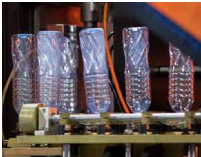
Plastic bottle moulding

Once the fluorination process is complete, the chamber and pipelines are flushed with nitrogen multiple times by bringing the vacuum chamber to 1 mbar and releasing to the atmospheric pressure to rinse the components, and to evacuate the chamber of exhaust gases.